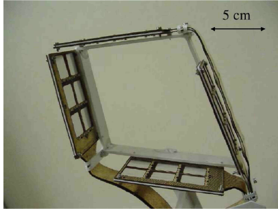
FIGURE 2. Photo of the the silicon pad counters used for the registration of spectator protons.

excess energy as well as the direction of the reaction center-of-mass velocity varies from event to event, enabling a significant fraction of deuterons to leave the dipole through a small window (see fig. 1), where they are registered by means of the drift chamber D4 and the scintillation hodoscope S^{D4} . The latter build out of five independent detection layers each of 5 mm thickness (see fig. 3). The ionization power of deuterons is only 30% larger than that of protons in the relevant momentum range (2.2 GeV/c), but the energy resolution of the detectors (25% FWHM) allows for an efficient separation of signals from protons and deuterons. In the off-line analysis the energy loss in these five